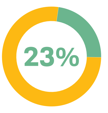
23% of residents in Cook County are Black